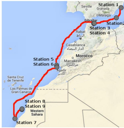
Fig. 1. Location of the measurement sites during the ALOMEX 2015 cruise.