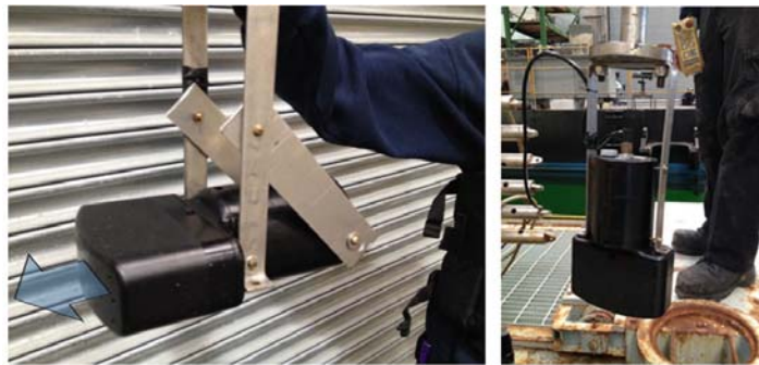
Fig. 1: The Teledyne BlueView P450-45 sonar head [8]. Two mounting positions were used for anechoic ultrasonic field measurements: horizontal mounting (left) for far-field measurements (beyond 2 m from the sonar face), and vertical mounting (right) for near-field.. The sonar beam direction (axis) is indicated by the arrow.

The purpose here is to summarize the assessment [6,7] of the ultrasonic safety for the Teledyne Blueview P450-45 series imaging sonar in Fig. (1), which features in a version of the diver hand-held sonar package made by Shark Marine Technologies (not shown) that is currently deployed for operational use by the Canadian Fleet Diving Unit. The method used for that sonar could be applied to other classes of imaging sonars.